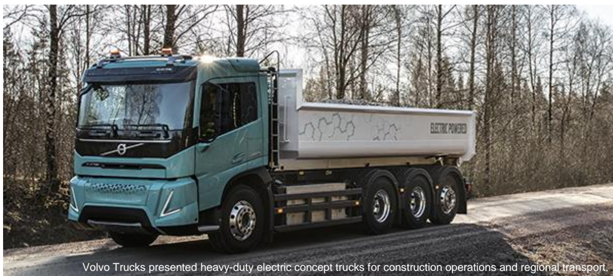
Volvo Trucks presented heavy-duty electric concept trucks for construction operations and regional transport.