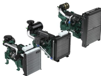
Volvo Penta's new range of power generation engines.

During 2019, parts of the marine leisure market softened and Volvo Penta faces increased competition from the outboard engine segment in parts of the power range. However, there was still growth in large yachts, which is a segment where Volvo Penta continued to gain market share.