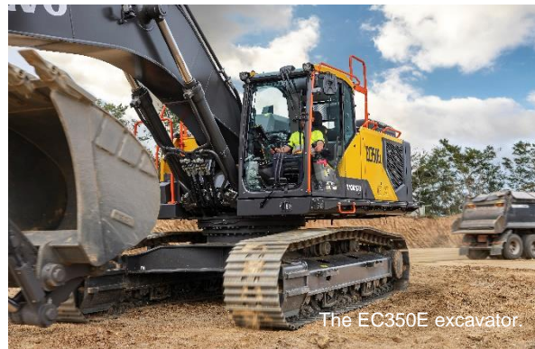
The EC350E excavator.