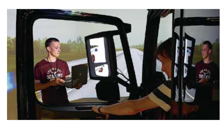
Comprehensive research for increased safety and security.

Volvo and safety belong together. That's the way I see it and that's also the way my predecessors have seen it all the way from day one of the company's operations back in 1927. I have a strong feeling that the entire Volvo Group is proud of the expertise and experience provided by 80 years of our work with safety. This has had a very definite effect on our way of developing products and services. It has led to us introducing many innovative solutions that have enhanced safety in and around our products.