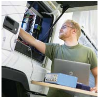
Telematics is an important research area for enhanced safety.