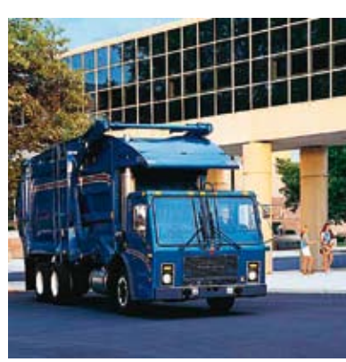
Safety is largely about improving the interplay between the Volvo Group's products and other road users in a complex traffic environment.