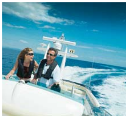
Safety on board a boat requires an engine that is highly reliable.