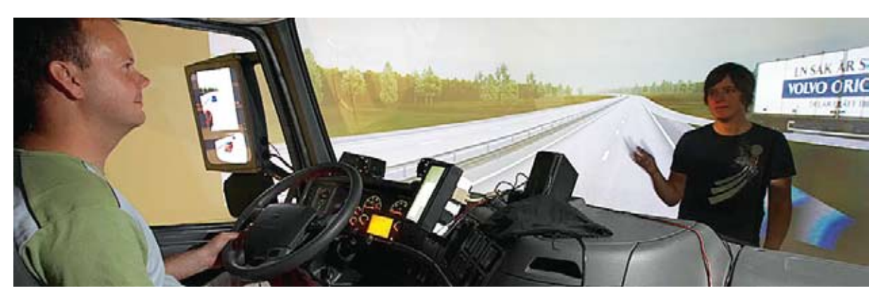
The Volvo Group uses, among other things, driving simulators when developing new safety systems for its various products.

The Volvo Group's development and research resources gather together comprehensive expertise so as to continuously develop new systems for safety and security.