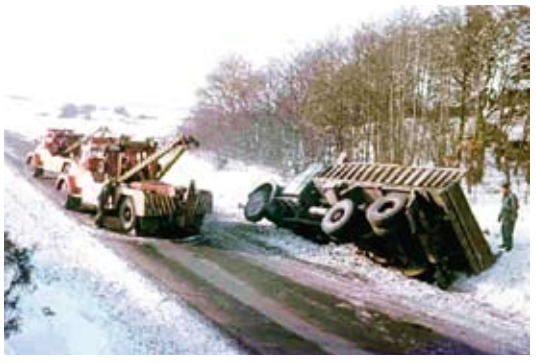
The Accident Investigation Team started investigating accidents involving trucks and buses way back in 1969.

What happened prior to the accident? With the help of tyre marks on the road surface, the tachograph and interviews, the experts may be able to ascertain