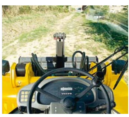
Good all-round visibility is important to safety.