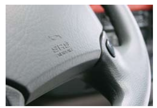
Airbags are an important safety feature in trucks.