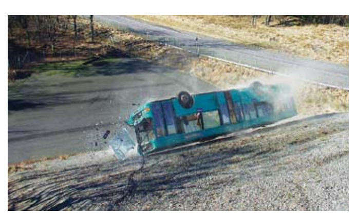
Full-scale collision tests are carried out, for instance rollover tests with buses.

5. "Post-crash" is the phase after the accident, when an action may for instance involve alerting the emergency rescue services and using the mobile phone network to transmit data about the collision to the alarm call centre.