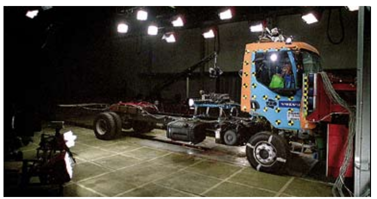
Physical full-scale impact tests supplement the development engineers' collision simulations.