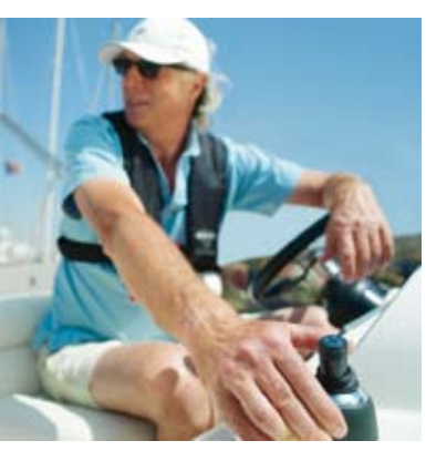
Safe and simple operation in port with Volvo Penta IPS and a joystick.