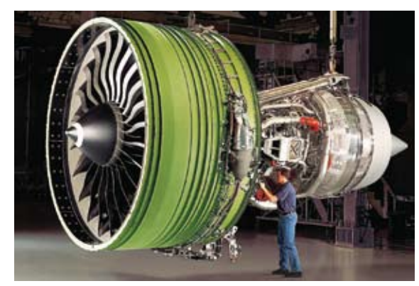
Our goal is that all our engines should offer 100 percent reliability.