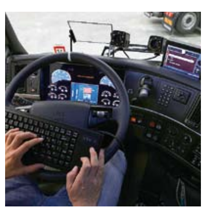
Mobile laboratories are used, such as this Volvo Integrated Safety Truck.