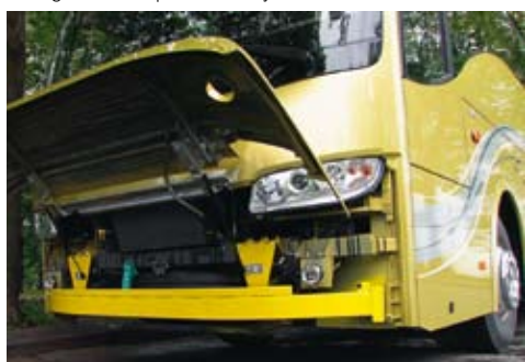
FUPS - front underrun protection to reduce the consequences on a car of a collision with a coach.