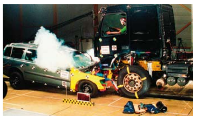
Physical impact tests are an important part of the development of new products, as are collision simulations and accident investigations.

many important facts leading to the accident. Why did the various preventive safety systems not succeed in preventing the accident?