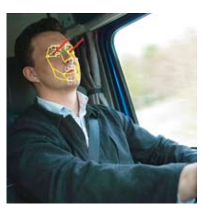
In one of Volvo's research projects, the driver's head and eye movements are monitored to detect any signs of inattentiveness.