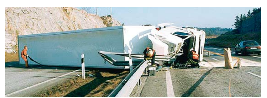
Since its launch, the Volvo Trucks Accident Investigation Team has studied more than 1500 accidents on site, as well as several thousand accidents the world over through reports and medical records.

Every time the alarm sounds regarding an accident near Volvo in Göteborg involving a truck or bus bearing the company's badge, Volvo's accident investigation team is also alerted. This allows all the important factors relating to the accident and its causes to be studied in detail on site.