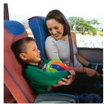
Everyone in a coach needs both comfort and safety belts.