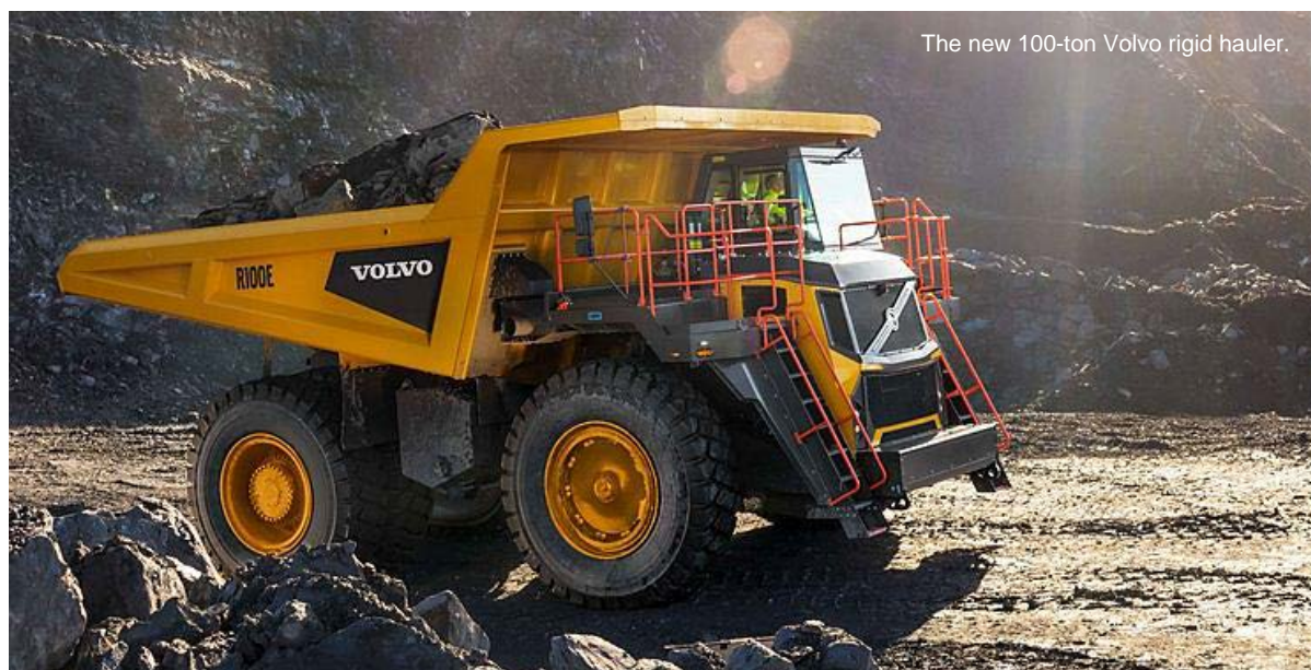
The new 100-ton Volvo rigid hauler.