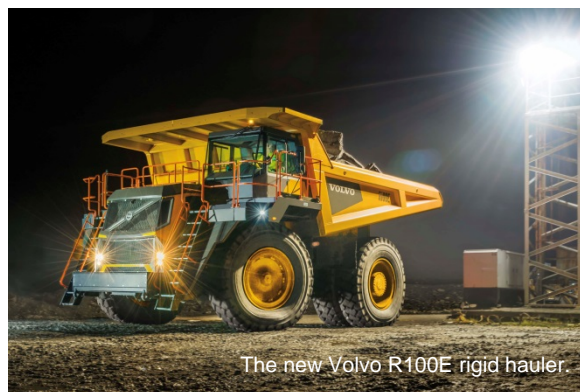
The new Volvo R100E rigid hauler.